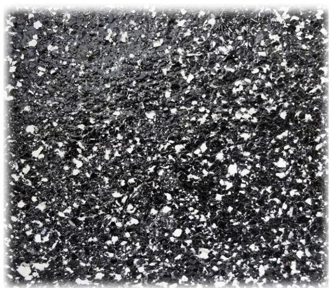
RG-2 (melns + 10% balts)