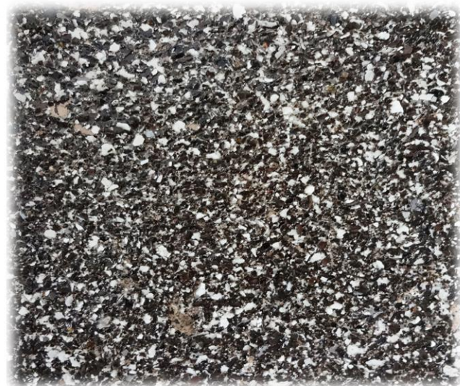
RG-4 (brūns + 10% balts)