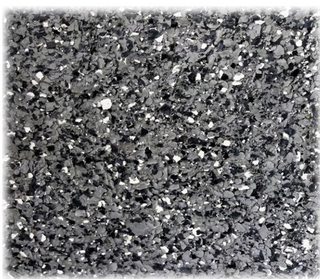
RG-1 (pelēks + 10% melns/balts)